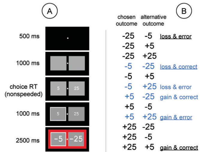
Figure 1. (A) Example of stimulus events in the gambling task. The duration of each stimulus event is indicated. See text for details. (B) List of possible combinations of chosen outcome and alternative outcome. The blue conditions indicate the four conditions chosen here to analyze the effects of gain versus loss and correct versus error. The underlined conditions indicate the four conditions chosen by Gehring and Willoughby (2002a). 'Loss' and 'gain' indicate that the chosen outcome yielded a financial penalty or reward, respectively. 'Error' indicates that the alternative outcome would have yielded a larger reward or a smaller penalty, relative to the chosen outcome. 'Correct' indicates that the alternative outcome would have yielded a smaller reward or a larger penalty, relative to the chosen outcome.

Each trial (see Fig. 1A) started with the presentation of a fixation point, which remained on the screen during the whole trial. After 500 ms, two rectangles appeared on either side of the fixation point, marking the locations of the upcoming choice alternatives. After 1 s, the numeral '5' or '25' (indicating US cents) was presented in each of the rectangles. Participants then selected one of the two choice alternatives by pressing a corresponding response button with their left or right index finger. This choice was highlighted by a thickening of the white outline of the corresponding rectangle. One second after the choice response, the chosen and alternative outcomes were displayed by revealing the sign (+ or -) of each numeral. To emphasize the gain/loss (Experiment 1) or the correct/error (Experiment 2) value of the chosen outcome, a colored rectangle, red or green, was displayed around the two outcomes. [The nature of the feedback display differed somewhat from that used by Gehring and Willoughby (2002a). In their experiment, color was the only indication of whether each outcome was associated with a gain or a loss of money (i.e. there were no '+' and '-' symbols). We used '+' and '-' symbols to indicate the valence of the outcomes, so that color could be used independently to emphasize either the gain/loss dimension or the